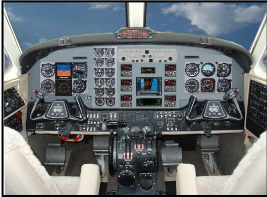
King Air B200 Interior Shown