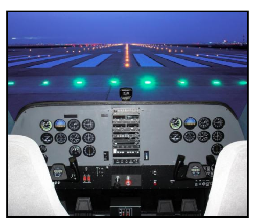
SFT-3000 Interior (C172 Configuration)